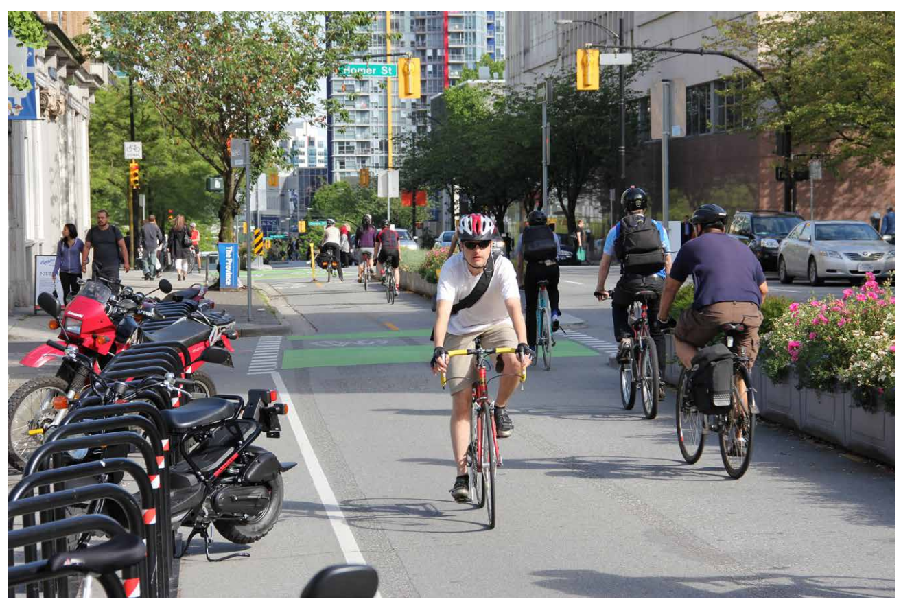
By designing streets to serve pedestrians, bicyclists and transit – including by adding infrastructure like this separated bike lane in Vancouver – cities can encourage low-carbon transportation and make streets safer for everyone.

Cities and transit agencies need to maintain, expand and improve public transit service. There are many ways to do this, including