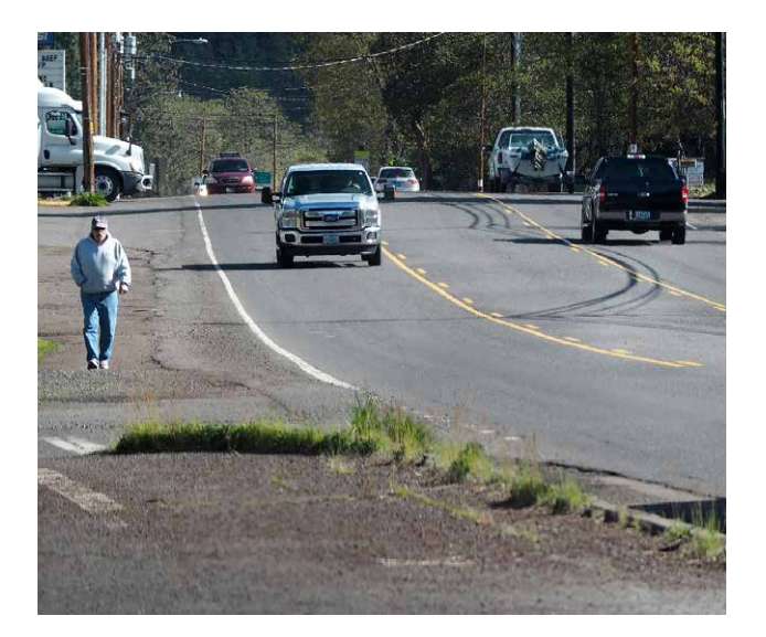
Roads without infrastructure for walking and biking make it less safe and more difficult to get around without a car. This area of Shady Cove, Oregon, was later the focus of an improvement project to add sidewalks and bike lanes.

Many roads also lack basic infrastructure that improves safety for walking and biking, like sidewalks and bike lanes.<sup>99</sup> A study of pedestrian crashes from the early 1990s found that, of the 2,885 incidents where such data was available, more than 80 percent took place on roads with no sidewalk.<sup>100</sup> Another study found that