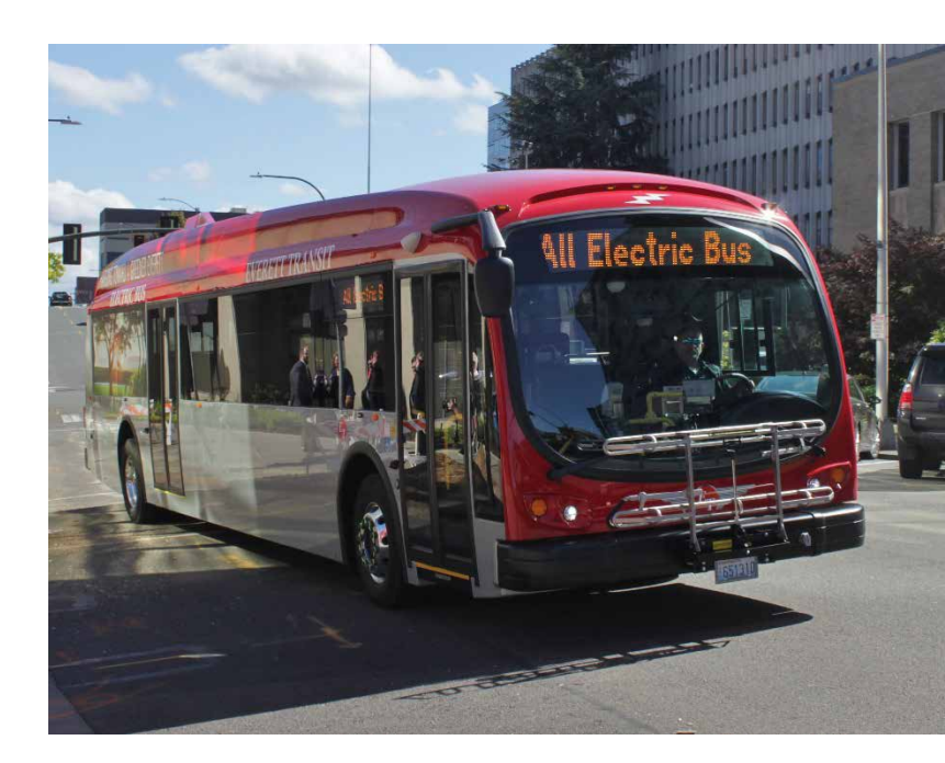
Electric buses reduce greenhouse gas emissions and bring important public health benefits both to the densely populated areas that transit buses often serve, and to young people who ride school buses.

By electrifying all transit and school buses, America can ensure that public transit, which is already cleaner and more efficient than