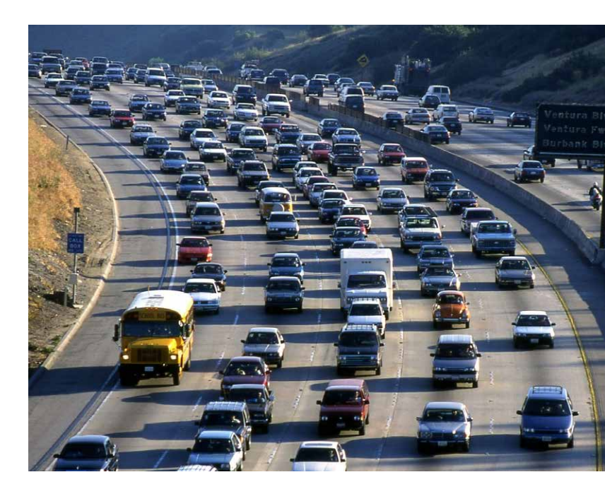
Around 85 percent of Americans commute to work by car. Research shows that all this driving takes a toll on our mental and physical health.

But the climate impacts of our automobile dependence don't just come from tailpipe emissions. The total carbon footprint of a