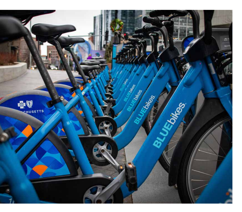
Programs that promote forms of shared micromobility, like bike-sharing, have been proven to help people reduce their reliance on cars.

Cities, employers and college campuses should pursue policies that encourage forms of shared micromobility, such as car-, bike- and scooter-sharing, which give people short-term access to transportation on an 'as-needed' basis.<sup>180</sup> Such programs have been proven to help people lead lifestyles that don't require owning a car, or that require owning fewer cars.