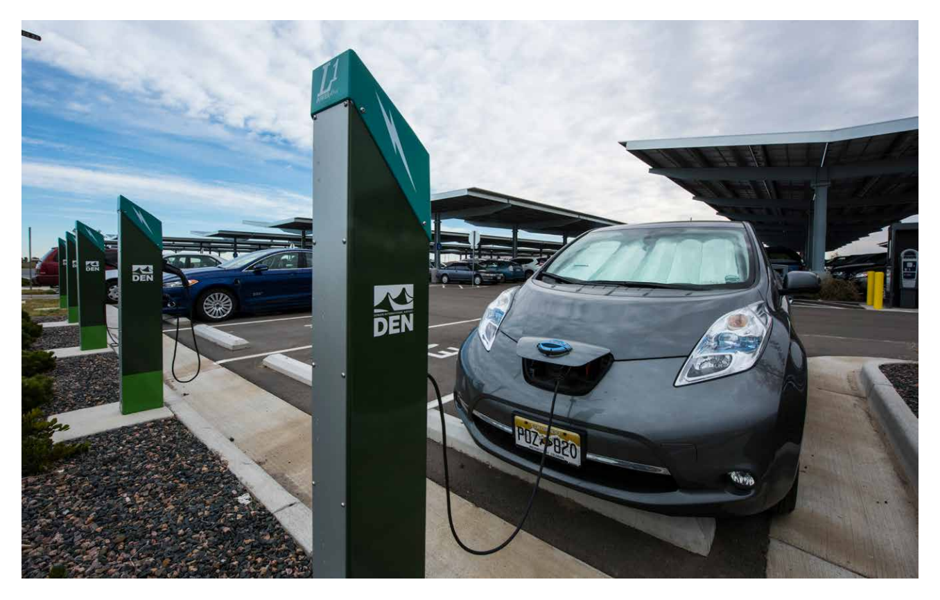
This electric vehicle charging station is powered by solar panels installed on a parking canopy. Because electric vehicles can be powered by clean energy sources including wind and solar power, they can enable a transition to a zero-carbon transportation future.

A growing body of research links noise pollution to a wide range of serious health impacts.<sup>251</sup> These include increased risk for cardiovascular disease and atrial fibrillation – which can increase the risk of heart failure and stroke – elevated stress levels, and impaired mental health.<sup>252</sup>